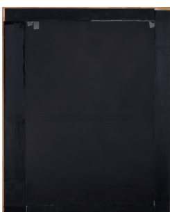
JAROMIR NOVOTNY (b. 1974, Český Brod) Untitled, 2016 Acrylic on canvas and polyester organza, acrylic dispersion, UV varnish (edges) 200 x 160 cm