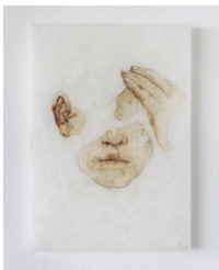
SOFIE MULLER Untitled Blood on alabaster 29,7 x 21 x 0,5 cm

Copyright: Duende Art Projects Photo: Valentin Clavairolles