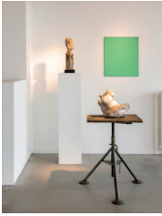
ECHOES Installation shot