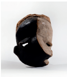
Pende Sickness Mask D.R. Congo Early 20 th century Wood. 19 cm