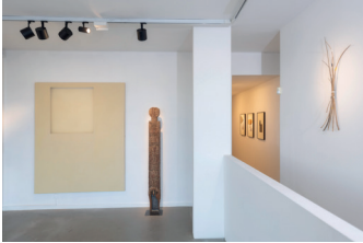
ECHOES Installation shot